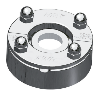
AWH-Connect with Sight Glass

The application possibilities of the AWH-Connect are almost endless!