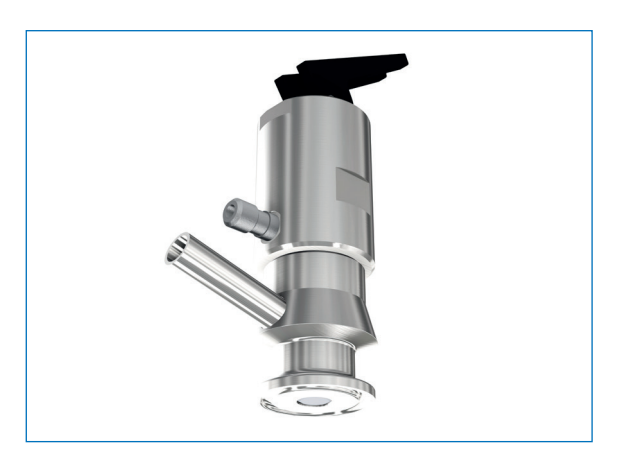
Pneumatic sampling valve