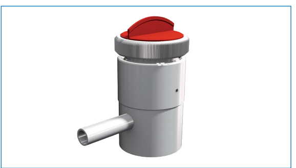
Sampling valve Vario DN40 weldon