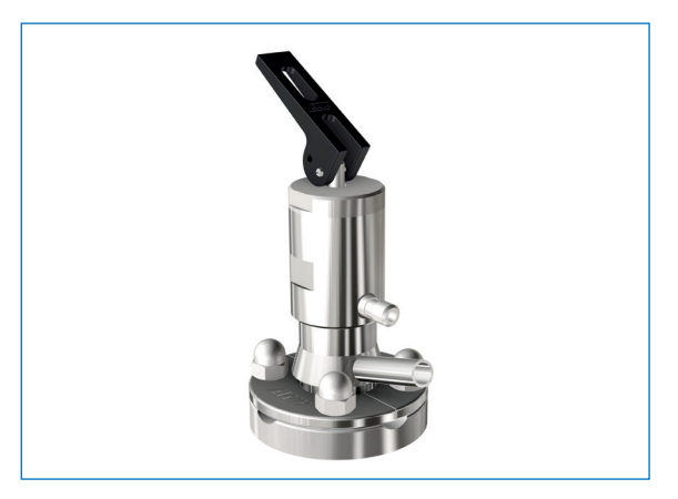
Pneumatic sampling valve connected to AWH-Connect

With the hygienic, pneumatic compact air sampling valve, there is also an automatic sampling system with additional manual actuation in the AWH portfolio.