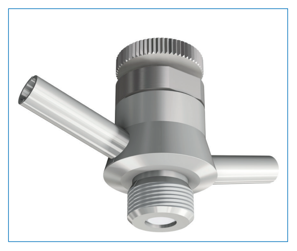
Sampling Valve manually operated with Male Part Adapter

We make hygiene affordable. This is now also backed up by the enhanced AWH sampling valve. When it comes to determining taste, appearance, and microbiological and chemical values, taking accurate samples is paramount.