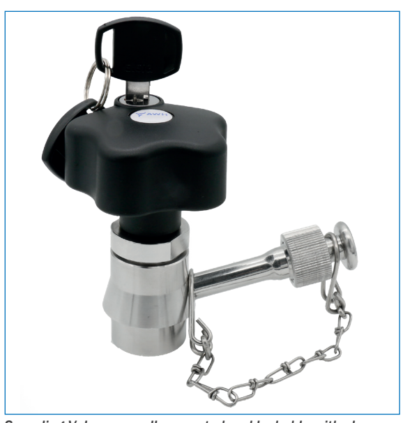
Sampling Valve manually operated and lockable with closure cap for sealing into a container.

The new AWH sampling valve comes in four different versions with a variety of connection types for a wide range of applications: whether in the weld-in, weld-on, screw-in, or clamp-socket version. An optional rinsing connection can be attached for all versions.