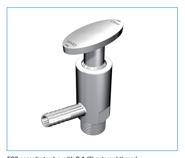
ECO sampling valve with R 1/2" external thread

The AWH ECO version is the economical entry into the AWH product portfolio. Suitable for product sampling of fluids from tanks and pipelines in systems of the food and beverage industry. The sampler is available in screw-in and weldon versions. It is sealed with a PTFE stopper that closes near the product.